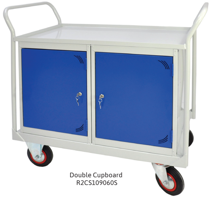
Double Cupboard R2CS109060S