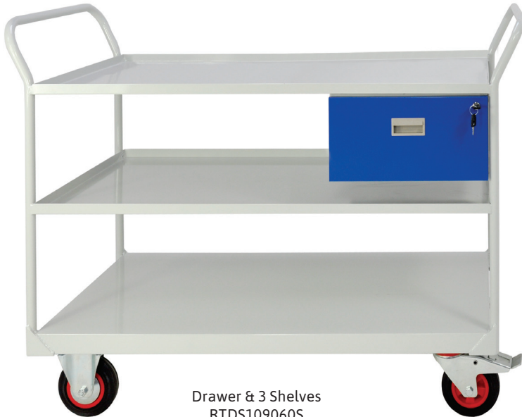
Drawer & 3 Shelves RTDS109060S

Ideal for mobile maintenance stations and for mobile fitting and assembly work. Available with cupboard or drawer for secure storage of tools and equipment.