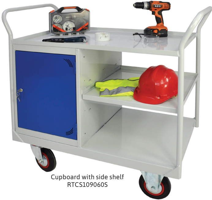
Cupboard with side shelf RTCS109060S